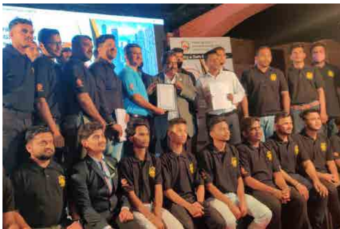
Installation ceremony of the newly created FSAI student chapter at Sahyadri college of Fire engineering & Safety Management, Nashik.