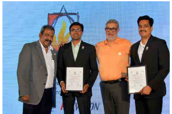
Installation of the President and Secretary of Nashik chapter which got elevated as a full fledged chapter of FSAI.