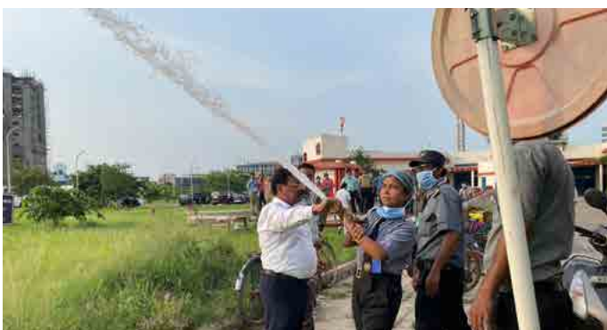
One female staff charging water using hose and branch pipe.