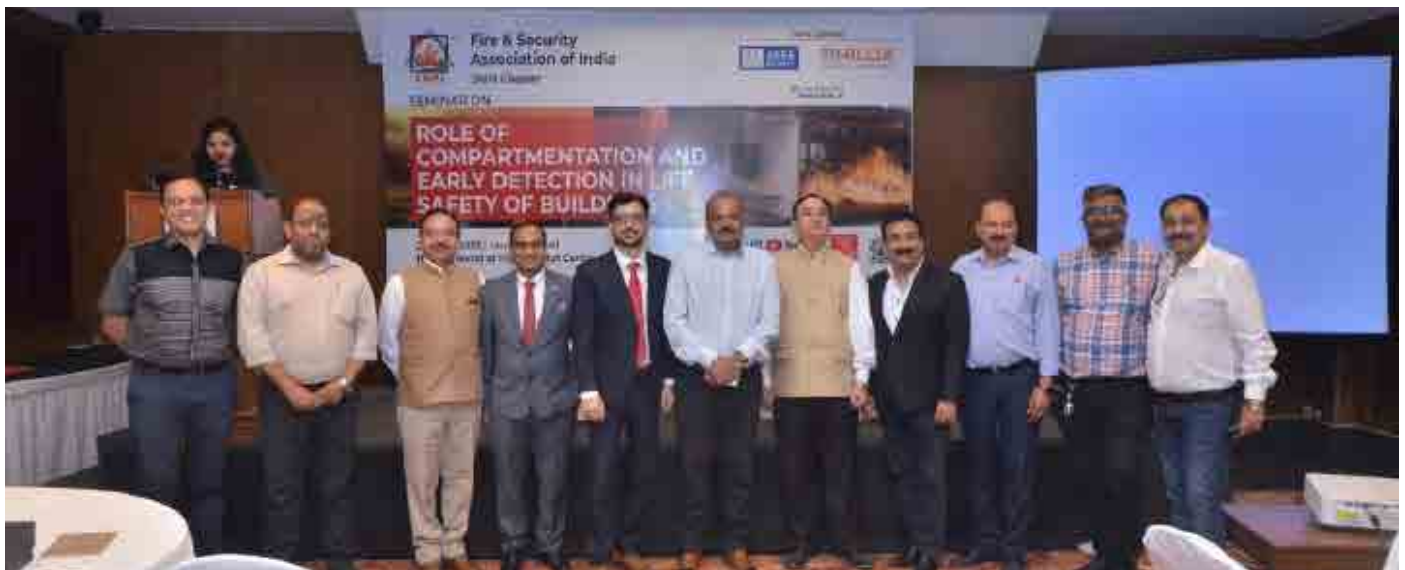
Group of outgoing and incoming team along with Chief Guest and others.