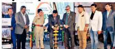
Speakers at inauguration ceremony