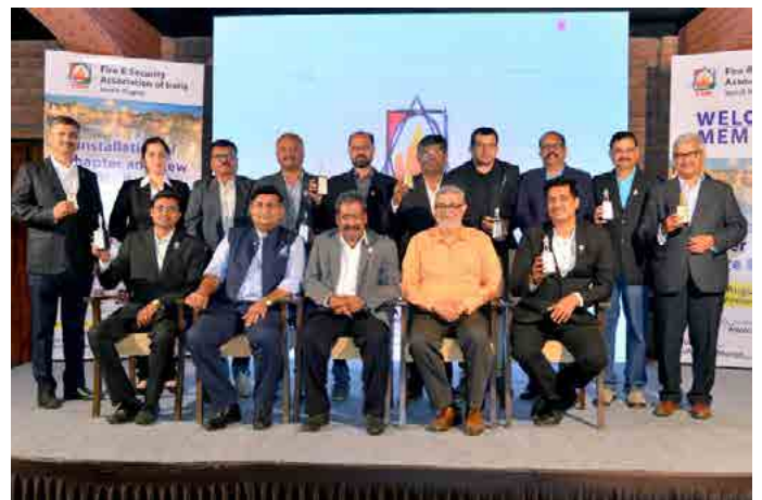
Group photo of Nashik chapter covering the newly installed heads and CWC members.