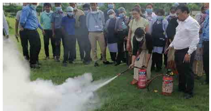
One female staff charging portable fire extinguisher at the sit of the fire.